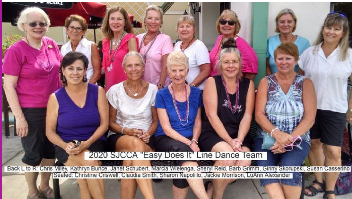
2020 SJCCA "Easy Does It" Line Dance Team