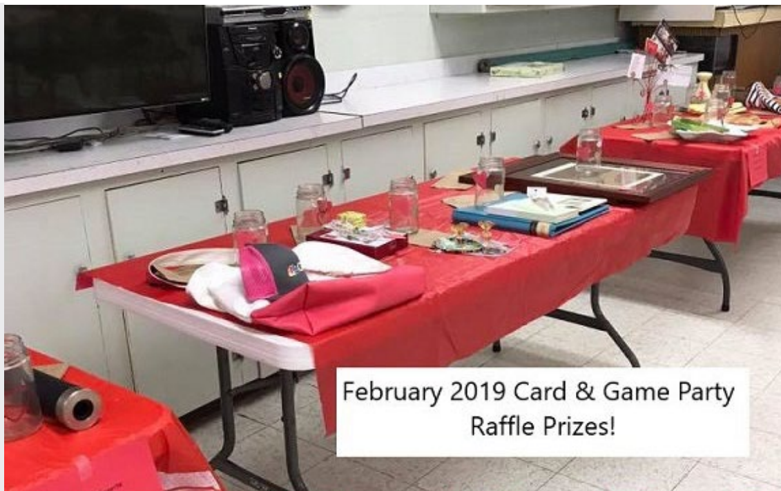
February 2019 Card & Game Party Raffle Prizes!