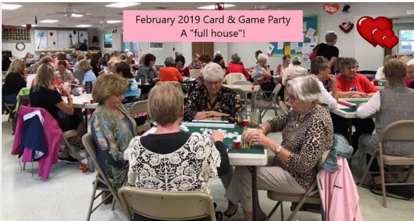
February 2019 Card & Game Party A "full house"!