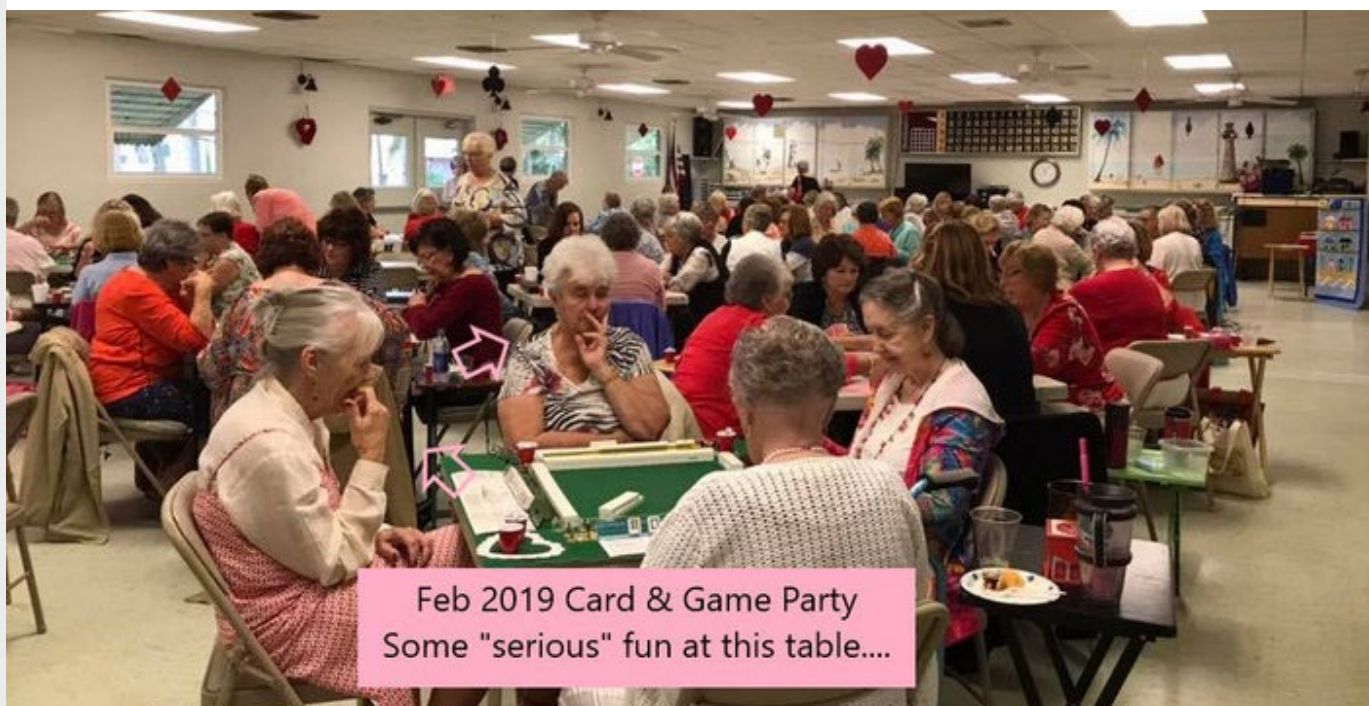
Feb 2019 Card & Game Party Some "serious" fun at this table....