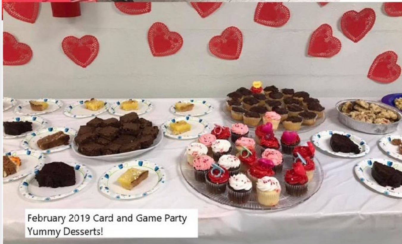
February 2019 Card and Game Party Yummy Desserts!