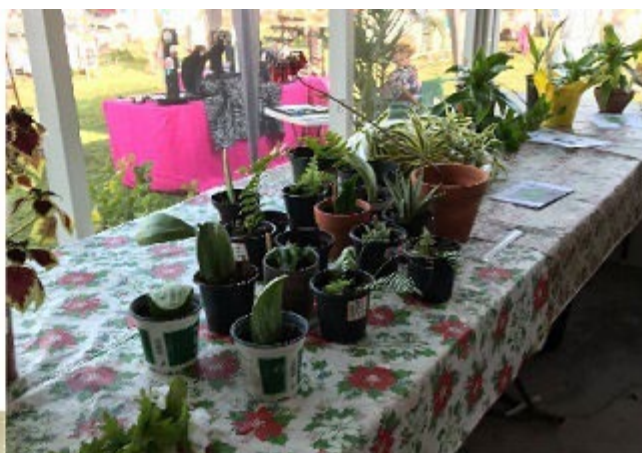
↑ Plant Sale