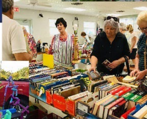
"Bickering and Bartering" for bargains!